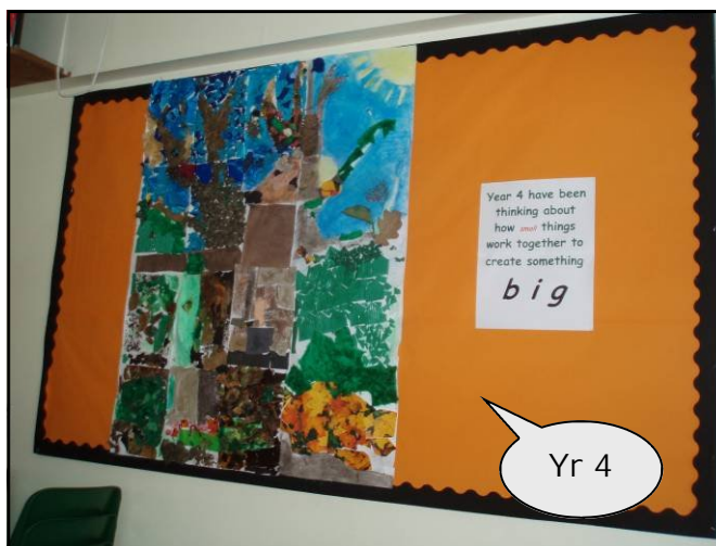
More brilliant science and art work!